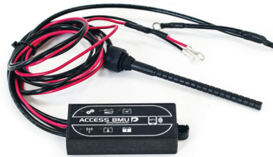
Battery Monitoring Unit (BMU)